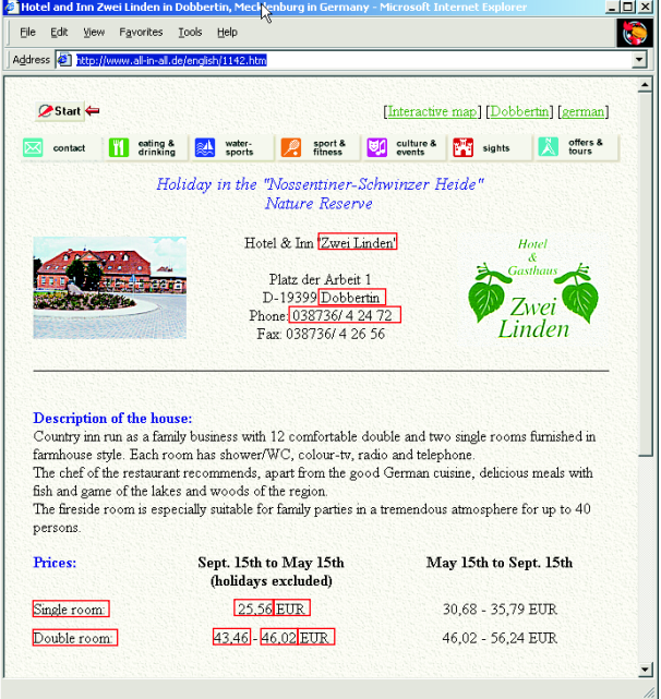
Fig. 1. Annotation example